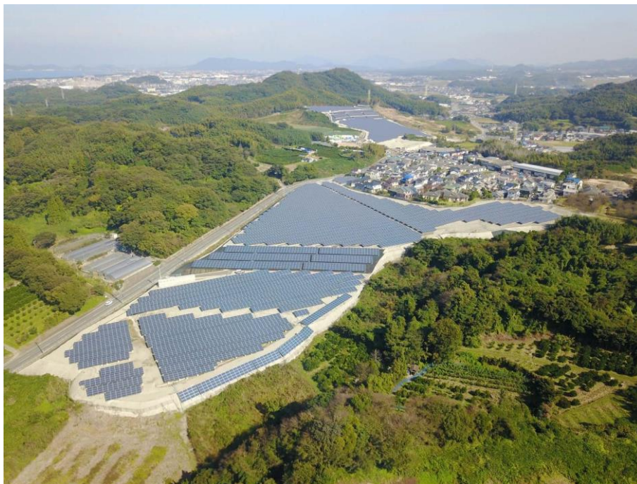
(Example) Solar power plant where jSEO provides O&M services

The company also started service at the Shibushi Matsuyama 1st, 2nd, 3rd Solar Power Plant (output: 2.2MWp) solar sharing (farm-based solar power generation) project that the Shizen Energy Group developed in Kagoshima Prefecture in April of this year. jSEO will continue offering services tailored to diversifying power generation businesses in Japan, including for roof-mounted equipment at plants and facilities.